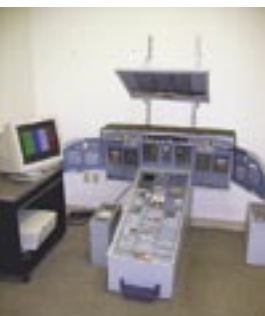
Jet Stream (CPT) Cockpit Visual Trainer (3) CRJ (CPT's) Cockpit Visual Trainers, No Electronics CRJ Maintenance Training Manuals (2 Sets)