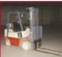
Nissan Mdl. CPJ-02A25PV 4,000 Lb. Forklift, 3 Stage 18' Mast, Side Shift, Propane, Hard Rubber Tires Crown Electric Pallet Jack Mdl. 30WTL Liftrite 5,000 Lb. Pallet Jack Forklift Extensions