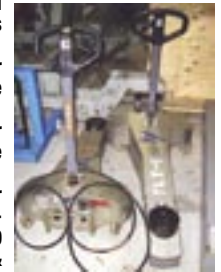
(2 ea) Tronair Mdl. 14- 6883-0110 Well & Brake Dol- lies & Jacks