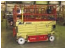
(4) JLG Mdl. 265E3 Electric Drive A- Round Scissors Lifts, 26' Max Plat- form Height, 1,000 Lb. Cap.