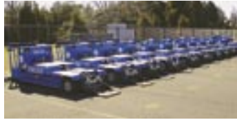
(14 ea) Lektro Inc. Mdl. AP8750B-A, 7,500 Lb. Electric Aircraft Tugs For CRJ's. Mfg. 2004