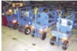
(5) Tronair 4 Bottle Nitrogen/Oxygen Carts