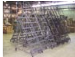
(16) Cotterman & Biltmore 7' & 8' Roll- A-Round Inventory & Maintenance Ladders