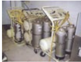
(3) Tronair Engine Compressor Wash Carts