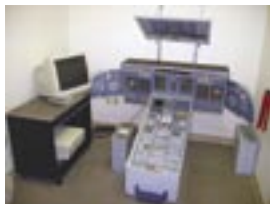
(2) CRJ FMS, CPT Trainers (1) Has Computer Hard Drive & Flight Data Computer, (1) Less Hard Drive