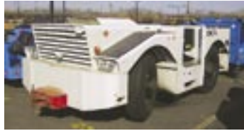
(1) Hough Mdl. T-180 Push Back Tractor, Detroit Diesel, Auto Trans.