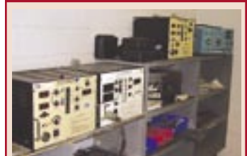
(2 ea) Aero Quality Superseder III Nicad Battery Charger Analyzers (3 ea) Aero Quality Superseder II Nicad Battery Charger Analyzers (1 ea) Christie Nicad Battery Charger Analyzer