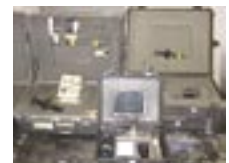
(2 ea) Machida Mdl. FBA-4-120TP Fiber Optics Borescopes 48" Flex Shaft w/ Machida LB-24 Light Sources