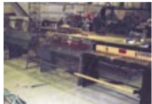
Wysong Mdl. 1562 Sheet Metal Shear 52"