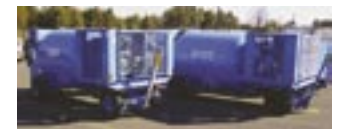
(3) Arvico Stordair Pneumatic Start Bottles w/Electric Ingersol Rand Compressors, Adjustable to 40 Psig, 0-300 Lbs./Min.