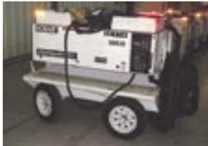
(4) Hobart Powermaster Electric G.P.U.'s 90 KVA, 400 Hz