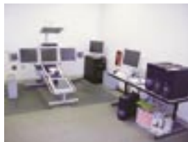
(2) Simfinity Integrated Procedure Trainers w/Flat Screens, Computers & Software