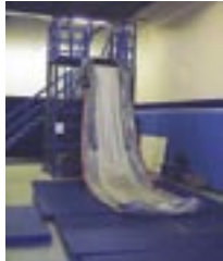
Shop Built Slide Trainer w/Stairs Slide & Mats

The Trainer is Equipped With The Following: BFE Aircraft Galley, Forward & Aft Flight Attendant Seats, Cockpit Door, (3) Non Functioning Lavs, Escape Path Lighting, Passenger Seats, Communications System, P/A System, (2) Active PSU's, Overhead Bins, Emergency & Cabin Lighting, Smoke System, AC, Lav. Smoke Detector, Seat Track, Door Liners, Etc.