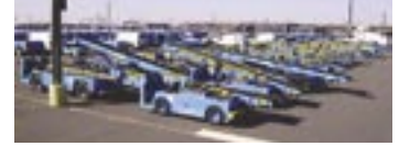
(9 ea) Stewart Stevenson Tug Mdl. 660-241 Belt Loaders, Deutz Diesel Engines 2,000 Lb. Cap. 24' Belt. Mfg. "04" & "05"