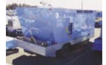
TLD Mdl. ACE-600-180-DDP Air Start Cart, Airflow Rate 180 Lb. Per Min., Detroit Diesel Engine. Mfg. "04" Very Low Hours w/Air Cooled Twin Screw Compressor, Trailer Mounted