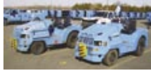
(80 ea) Harlan Mdl. HTAG-50 Baggage Tugs. 5,000 Lb. D.B.P., Ford 6 Cyl. Engines, Auto Trans., Some w/Cabs. Mfg. Dates 1999 To 2001