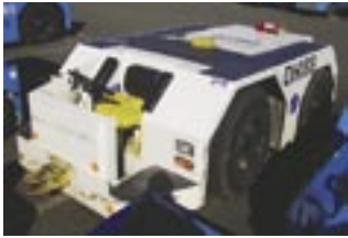
(1) Stewart Stevenson Mdl. GT-32 Push Back Tractor, Detroit Diesel Engine, Automatic Trans.