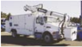
(5 ea) 2003 Sterling Acterra De-Ice Trucks w/Mercedes Diesel Engines & Auto Trans., Trucks Have Premier Mdl. MT-43P21 De-Icer Units 1,700 Gal. Type 1 Tank, 400 Gal. Type 4 Tank, (3 ea) Heaters Pump System Powered By Perkins Diesel Generator, VersaLift Boom 40'+ High, 34'+ Long