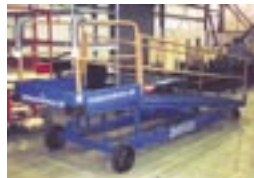
Tronair B-1 Stand (8) Cotterman 3' & 5' Roll-A-Round In- ventory & Maintenance Ladders (2) Triarc 17' Maintenance Ladders