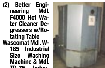
(2) Better Engineering Mdl. F4000 Hot Water Cleaner Degreasers w/Rotating Table Wascomat Mdl. W-185 Industrial Size Washing Machine & Mdl. TD-75 Industrial Dryer, For Rugs, Seat Covers, Etc. 42" Shop Fans Several 36" Pedestal Fans Snap On Mdl. WB-250-Air Computer Wheel Balancer & Weight Kit Tire Inflation Gauge Tronair Mdl. 14-6801-0120 Pneumatic Tire Bead Breaker Wet Dry Shop Vacs