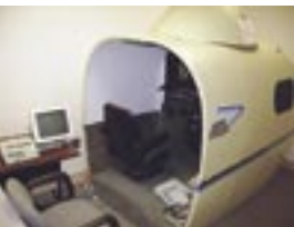
Aviation Simulation Technology Multi Engine Simulator w/Plotter & Multi Engine Instructor Console