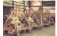
(2) Regent Mdl. 12-60-72, 12 Ton Airbus Jacks (New)