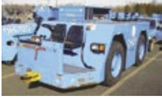
(5 ea) Stewart & Stevenson Mdl. GT-35A Push Back Tractors, Deutz Mdl. 8DZXL04 Diesel Engines, Automatic Trans. 30,000 Lb. DBP. Year Mfg. 2004