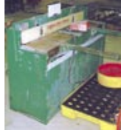
Tennsmith 52" Mdl. H5216 Power Shear Dayton Mdl. 4YG33 52" Finger Brake Tennsmith 48" Finger Brake Mdl. HBU-4816 Tennsmith 48" Bench Top Finger Brake Mdl. HBU-4816