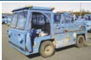
(8) Tug Mdl. MH50-1 Flatbed Maintenance/Baggage Trucks, Ford 6 Cyl., Auto Trans. 3,000 D.B.P.