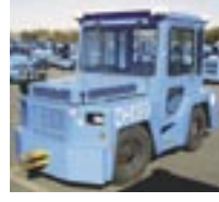
(5 ea) A&G Mercury Mdl. 120-D Push Tractors w/Cabs, Cummins 4 Cyl. Diesel Engine, Auto Trans., 24,000 Lb. DBP. Mfg. 2003