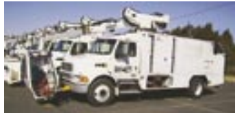
(3 ea) 2002 Sterling Acterra De-Ice Trucks w/Mercedes Diesel Engines & Auto Trans. Trucks Have Premier Mdl. MT43P21-E De-Icer Units, 1,700 Gal. Type 1 Tanks, 400 Gal. Type 4 Tanks, (3 ea) Heaters, Perkins Generator VersaLift Booms 40' Heights, 34' Long w/Enclosed Buckets