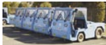
(19) Stewart Stevenson Mdl. MX4A Baggage Tugs. 4,500 Lb. D.B.P., Hybrid Electric/Diesel w/Cabs. Mfg. 2004

Note: Some of The Harlan Tugs Are High Speed