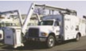
(2) "1999" Ford F Series De-Ice Trucks w/Cummins Diesel Engines, Auto Trans. Trucks Have Superior Mdl. 2045 De-Icer Units Built By SDI Aviation w/1,600 Gal. Type 1 Tanks, 400 Gal. Type 4 Tanks, 3 Heaters, John Deere Diesel Engine Generators, Boom Heights 40' to 47', Length 32'