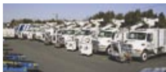
(5 ea) "1994" To "1998" Ford F Series De-Ice Trucks w/Cummins Diesel Engines, Auto Trans. Trucks Have Superior Mdl. 2045 De-Icer Units Built By SDI Aviation w/1,600 Gal. Type 1 Tanks, 400 Gal. Type 4 Tanks, 3 Heaters, John Deere Diesel Engine Generators, Boom Heights 40' To 47', Length 32'