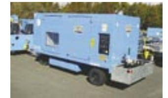
(4 ea) TLD Mdl. ACE-600-100 Air Start Cart Air Flow Rate 100 PPM, Up to 40 Psig Start Air Press, Diesel Engine. Air Cooled Rotary Twin Screw Compressor, Low Hours