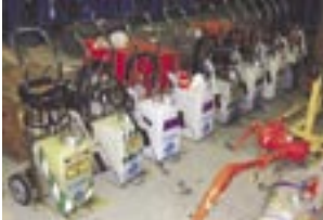
(4) Tronair Mdl. 06-5004-0500 Hyd. Servicing Units (25) Tronair Mdl. 06-5022-6500 Hyd. Servicing Units