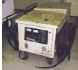
(2) Tronair Mdl. 11-6621-1000 G.P.U.'s 28 V. DC., 2000 Amp. A&P Hydraulics 5606 Hydraulic Servicing Cart