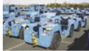
(19 ea) Eagle Mdl. TT-80 & TT-8 Push Tugs, 8,000 Lb. DBP, Isuzu & Continental 4 Cyl. Diesel Engines, Auto Trans., For CRJ Push. Years Mfg. 2000 & 1999