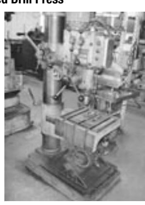
Modigs Type RPM 28 BL Swing Arm Radial Drill 1400 to 2800 RPM, Max Distance From Column to Center of Spindle 2' 3 3/8", Min. 9 1/4"

Powermatic Mdl. 1150 Bench Top Variable Speed Drill Press