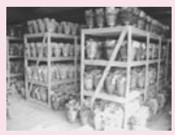
(310+) R-1820-76/84/86 Cylinder Cores Tapper Barrel