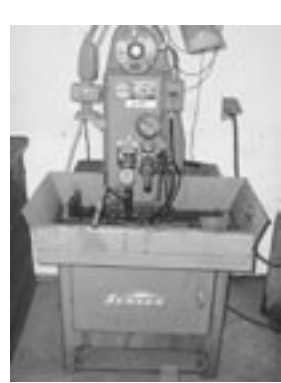
Sunnen Mdl. MBB-1660 Horizontal Rod Honing Machine w/Mandrels