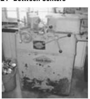
Kwik-way Valve Regrinding Machine Van Norman Mdl. CRW Valve Regrinding Machine w/Air Chuck & Quick Air Operated Collet