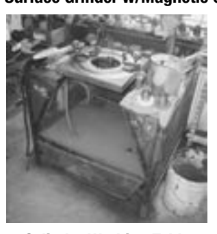
(2) Sioux Cylinder Working Tables w/Stone Dresser

(2) Sioux Valve Seat Drivers Cylinder Build Stand Cylinder Base Lapping Machine