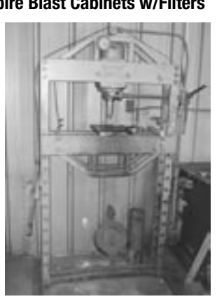
KR Wilson Mdl. 37G, 50 Ton H Frame Hyd.

Powermatic Mdl. 1150 Bench Top Variable Speed Drill Press