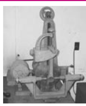
Greenlee Mdl. A-4F Link Rod Boring Fixture Link Rod Bushing Pressing Tools & Rollers

Fixture w/Mandrels Waddell Link Rod Boring Fixture Pedestal & Bench Grinders Bench Vices, Several R-2800 Seat Roller (3) Craftsman 14" Bench Top Band Saws Pexto Sheet Metal Beader, 12" Throat Niagra Sheet Metal Beader Craftsman 8" Belt & Disc Sander