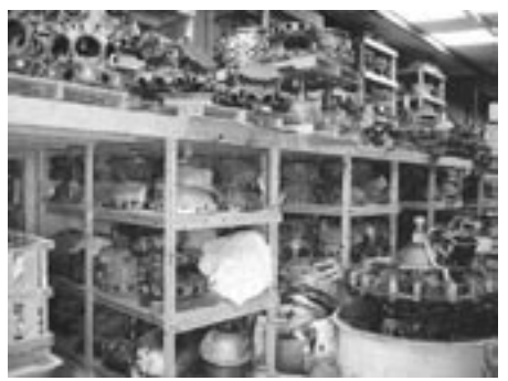
R-985 & R-1340 Crankshafts, Master & Link Rods Several 1820-82/84 Crankshafts, Heavy & Light R-1820 GC Crankshafts Several R-1830 Crankshafts (30+) R-1300 Crankshafts, Heavy &

Light Very Large Selection of All Types & Models of Crankshafts P&W & Curtis Wright