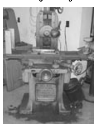
Mdl. CT-301 6" Carbide tool Grinder No. 25 Surface Grinder w/Magnetic Chuck