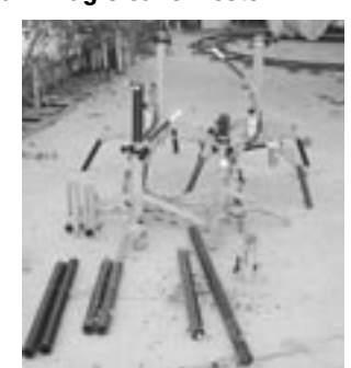
(2) Meyers 24" 3 Ton Aircraft Jacks (2) Meyers 42" 3 Ton Aircraft Jacks w/All Extensions Meyers Tail Stand

(2) Blackhawk 1 1/2 Ton Utility Jacks (2) High Wing Aircraft Jacks