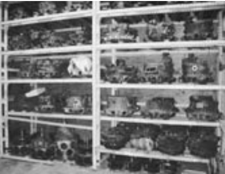
New 2800 B Prop Shafts Various Other Prop Shafts 1820/1300 Prop Shafts