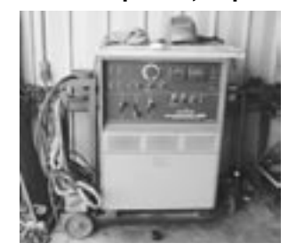
Miller Syncrowave 300 AC/DC Gas Tungsten Arc Welder w/Foot Control & Argon Atch. 200/230/460 Single Phase