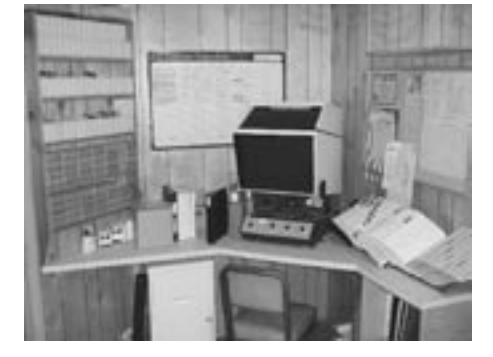
Very Large Selection of Overhaul & Parts Manuals For All Models of P&W & Curtis Wright Engines, Accessory Overhaul Manuals Several Rolls of P&W & Curtis Micro Film 3M 500 Reader Printer