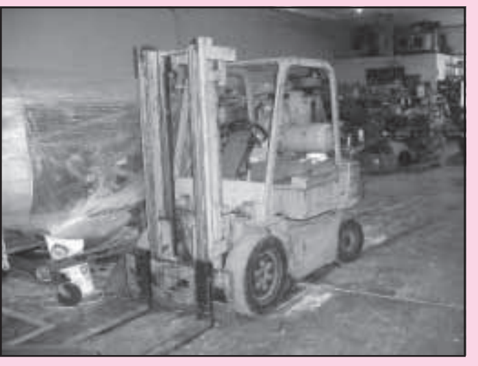
Caterpiller 4,000 Lb. Forklift, Propane, Hard Rubber Tires, Dual Stage 12 Ft. Mast

AUCTIONEER'S NOTE: The owners of JBQ Aviation Corp. are retiring from the Allison 501 Engine, Electra and Convair Business. They have therefore contracted with Starman Bros. Auctions to liquidate at public auction all assets. This auction will offer a large selection of Allison 501 inventory as well as props and L-188 and Convair accessories, new, overhauled and used. Everything sells "AS IS, WHERE IS" with no warranties implied or expressed. Neither the auctioneer now owners shall be liable for any incorrect description, fault, or defect. Everything positively sells to the highest bidder. Payment must be made in full day of sale. No property removed until settled for. Auctioneer not responsible for accidents or stolen property. All counts are approximate.