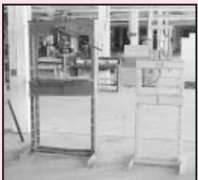
(2 Ea.) Erco Model 1447 Foot Operated Sheet Metal Shrinker/Stretchers