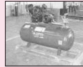
Campbell-Hausfeld Dual Stage Air Compressor, 10 H.P., 120 Gal. Tank, 175 PSI Max.