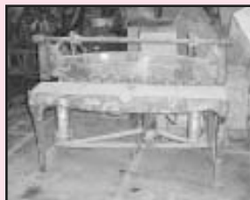
Pexto Model XC52C Air Operated 52" Sheet Metal Shear