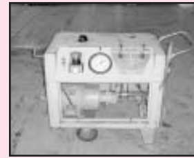
Air Right Hydraulic Mule, 5,000 PSI