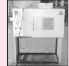
Associated Environmental Systems Environmental Chamber, Model SK 3105, Hot and Cold Refrigerant, 1,000 PSIG