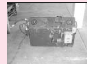
Dennison Engineering Hydro-matic Prop Test Stand (Feathering/Unfeathering) Hamilton Standard Prop Buildup Stand Sutton Remote Prop Balancing Kit

Large Selection of Hamilton Standard and Aero Product Prop Tools to Include (2 Ea.) Sweeny Torque Multipliers, Several Sweeny Adapters, Spanner Wrenches, Prop Blade Wrenches, Prop Sockets, Blade Nut Holder, Blade Angle Guides, Dome Nut Wrenches, Low Pitch Stop Nut Wrench, Prop Nut Adapters, Prop Slings, Etc., Several Other Pieces, Several Tow Behind and Stationary Prop Stands