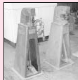
12' Prop Table with Dual Arbors 8' Prop Table with Hamilton Standard Arbor

Large Selection of Hamilton Standard and Aero Product Prop Tools to Include (2 Ea.) Sweeny Torque Multipliers, Several Sweeny Adapters, Spanner Wrenches, Prop Blade Wrenches, Prop Sockets, Blade Nut Holder, Blade Angle Guides, Dome Nut Wrenches, Low Pitch Stop Nut Wrench, Prop Nut Adapters, Prop Slings, Etc., Several Other Pieces, Several Tow Behind and Stationary Prop Stands