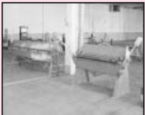
Chicago Model 816 8' Sheet Metal Brake Chicago Model BP0414-6 48" Finger Brake