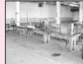
Landis 6x18 O.D. Grinder, 30" Table Banding Machines Square D Three Phase Transformer Several Hyd. Bottle Jacks