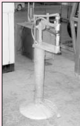
Chicago Pneumatic Plummeting Hammer, 12" Throat