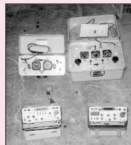
IFR ATC-600 A Ramp Transponder Test Set IFR Nav 401L Ramp Test Set Aerospace Instruments P/N EADT-351 Pitot Static Test Set AIS P/N ADT-5066E Pitot Static Test Set Collins Type 51RV-1 VOR/ILS Receiver Test Panel H.P. Model 200 CD Wide Range Oscillator A1-101 Radio Altimeter System Ramp Tester H.P. Model 3465A Digital Multimeter

Model 1312 Decade Oscillator 10 Hz to 1 MHz Heath Schlumberger Model EU-81A Function Generator Gyro Rate Table T.I.C. T-30B VOR/ILS Ramp Test Set Robinair Model 10970 Vacuum Pump RFL Model 107A Magnet Charger Deadweight Tester Racal Dana Model 5005-S-4622 Digital Multimeter H.P. Model 5245L Electronic Counter Vacuum Chamber Altimeter Test Panel Tachometer Test Panel Air Data Pneumatic Control Test Panel Synchro Test Panel Weller EC-102 Solder Stations Pace Solder DeSolder Station Temp. Indicator Test Panels Torque Meter Test Panel for P/N SRT-314A Model EA-315A Liquidometer Test Panel Kingsley Wire Marking Machine with Dies DC-Power Supply C2 and C4B Compass Test Panel Several Precision Pressure Gauges Emergency Lighting Battery Test Panel H.P. Oscilloscope Several Amp and Burndy Wire Strippers, Crimpers, Pin Insertion Tools, Cannon Plug Tools, Etc.