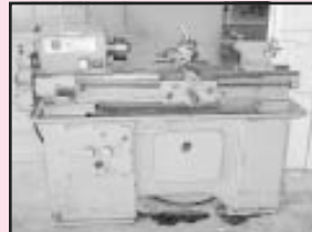
Summit Model 11-32 Metal Lathe, Various Chuck and Tools, Auto. Feed