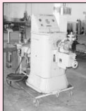
Allen Generator Test Stand R-2800 Crankshaft Build-Up Fixture Good Selection of Radial Engine Tools Including Cylinder Base Wrenches, Ring Compressors, Intake Tube Wrenches and Several Other Pieces