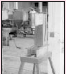
H.R. Wilson 10 Ton Type 1 Hydraulic Press, Hand Operated