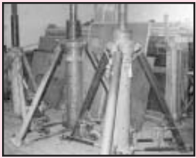
(2 Ea.) Malabar Model 524 50 Ton Aircraft Jacks