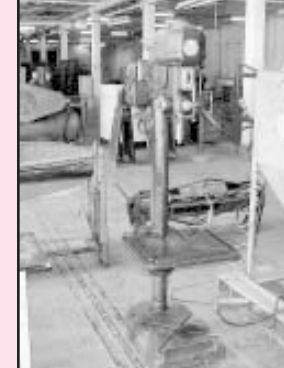
Walker-Turner Model 113-41 Floor Model Drill Press, 10" Throat, Variable Speed Wood and Metal