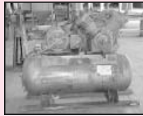
Kellogg Dual Head, Dual Stage Air Compressor, 25 H.P.