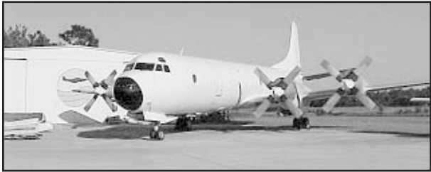
Note: The (2 Ea.) Electra L-188 aircraft will be sold subject to a minimum bid.

Note: All Convairs will sell absolute. Log books will be available at sale site. To pre-inspect the aircraft call Starman Bros. Aircraft are in a secure area and will need prearrangement to inspect. Inspection will also be available Thursday, July 25th, and Friday morning, July 26. Aircraft sell at 1:00 P.M., Friday, July 26th.