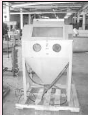
Dayton Model 3Z850 Bead Blast Cabinet with Side Load