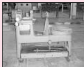
PWA-3000-100 Radial Engine Crankcase Disassembly/Assembly Stand (2 Ea.) Cylinder Working Stands (3 Ea.) Cylinder Honing and Reaming Machines Covel Grinder Hembrug Nederland Grinder