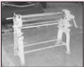
36" Heavy Duty Sheet Metal Roller