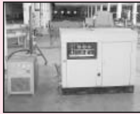
Ingersoll-Rand Pac-Air 60 Twin Screw Air Compressor Kellogg Model DSA Compressed Air Dryer

Blast-It-All Model 4426-1 Bead Blast Cabinet with Side Load (3 Ea.) Oxygen Acetylene Torch Sets with Carts (3 Ea.) Goodyear Wheel Balancers Tire Inflation Safety Cage Tire Bead Breaker Ward Powercraft 230 Amp Welder 3 Ton Hyd. Floor Jack Watco Model WT-20 20 Ton Air Over Hyd. Truck Jack Nitrogen Carts with Bottles and Gauges 1" Belt Sander (2 Ea.) Makita Chop Saws