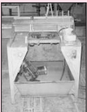
Sioux Wet Cylinder Working Table Wadel Model RBM Bushing Reamer Superior Model J2WR Horizontal Hone Whiting Rollover Engine Stand