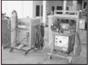
Lincoln Ideal Arc Tig AC/DC Arc Welder with Foot Control and Argon Attach., 220/440, 1 Ph.