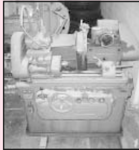
Dake Model 50 H Hydraulic H-Frame Press, 50 Ton 6 Ton H-Frame Hyd. Press