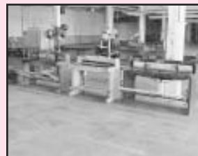
Peck & Stow Model 137-K 37" Sheet Metal Shear Tennsmith Model T-52 52" Sheet Metal Shear Pexto Model T-52 52" Sheet Metal Shear