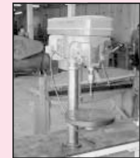
Chicago H.D. 12 Speed Drill Press, Bench Top (3 Ea.) 150,000 BTU Kerosene Heaters Large Selection of 24", 36" and 48" Box and Pedestal Shop Fans