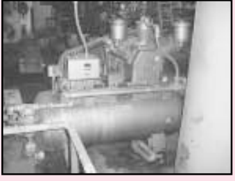
Leroi Model 4WC Air Compressor, 3 Stage, 10 H.P. Horizontal