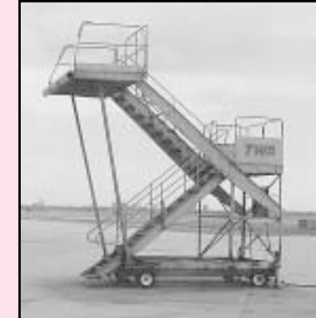
Wide Body Entryway Stairs Misc. CSD and Generator Jacks Main Wheel and Tire Jacks