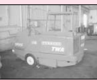
Tennant Model 282374 Drive Around Power Hangar Scrubber, 4 Cyl. Propane Engine