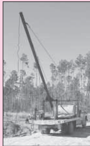
1977 Ford F-600 Boom Truck, V-8 Gas Engine, 5x2 Transmission, 20' Flatbed, 8,000 Lb. Winch