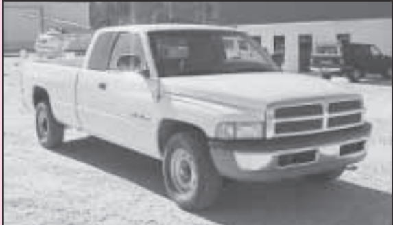
1998 Dodge Ram 2500 Quad Cab Pickup, 5.9 Liter Magnum Engine w/1,200 Miles on Overhaul, Auto. Trans., Cruise Control, Gooseneck Plate.