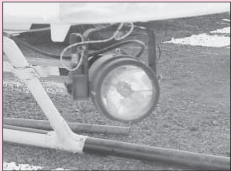
Spectrolab Starburst Search Light Assy. Model 5X5, Single Beam, 500 Watt w/Mounting Brackets.

AUCTIONEER'S NOTE: Starman Bros. Auctions, Inc. has been contracted by the owners of North Star Aero, Inc. to sell at Public Auction various flying helicopters, vehicles, and inventory that are surplus to their ongoing needs. This auction offers some very nice working OH-58C's as well as an excellent selection of support vehicles and inventory. Everything sells "As Is" "Where Is" with no warranties implied or expressed. Neither the auctioneers nor owners shall be liable for any incorrect description, fault or defect. Everything sells to the highest bidder. No property removed until settled for. Auctioneer is not responsible for accidents or stolen goods.