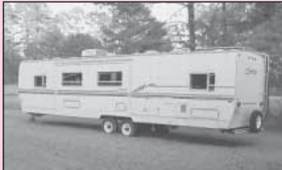
1997 Keystone 27' Sprinter Travel Trailer, Bumper Hitch, Slide-Out Living Room, Roof Mount A/C, 2 Bedroom. (2 Ea.) Fiberglass Pickup Toppers. (2 Ea.) Weather Guard Side Mount Truck Tool Boxes.