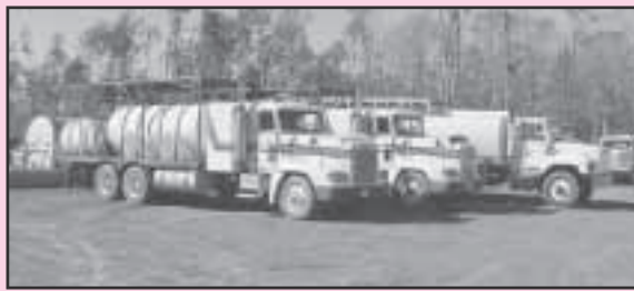
(2 Ea.) 1993 Freightliner Conventional Cab Nurse/Trucks w/Sleepers, 350 H.P. Cat Engines, 9 Speed Transmission, 300 Gal. Jet A Tanks, 2,600 Gal. (Poly) Water Tanks, 500 Gal. Batch Tanks w/3 In. Loading System Powered by 2 Honda Engines w/ Meters.