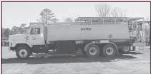
1998 International Conventional Cab Batch/Nurse Truck, 350 Cummins Engine, 9 Speed Transmission, 16,000 Lb. Front Axles, 46,000 Lb. Hendricks Rear Suspension, Jake Brake, Double Wall Aluminum DOT Spec 306 Divided Tank 800 Gal. Jet A & 3,600 Gal. Water, Top & Bottom Load, 1,000 Gal. Batch Tank, 3 In. Load System Driven by Kabota Diesel Engine