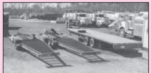
(2 Ea.) Southern Pride 27' Helicopter Transport Trailers, 12,500 Lb. Tandem Axle, Bumper Hitch. 1995 Bragg 30' Gooseneck Trailer, Tandem Axle 13,700 Lb. 16' Tandem Axle Trailer, Bumper Hitch. 28' Semi Trailer (Former Beer Delivery Trailer), Tandem Axle, w/7 Roll Up Doors on Each Side.