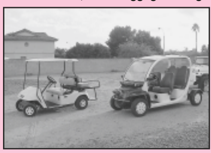
2000 GEM Car Mdl. E825, Battery Powered, 4 Place, Sony CD Player, Street Legal

1986 Ford 13 Passenger Bus on Ford 350 Econoline Frame w/National Coach Corp. Body. 7.5 Liter V-8, Auto. Trans., AM/FM, Front and Rear Air, Has Roof Top Air Conditioning Unit w/Onan Generator, Rear Baggage Storage