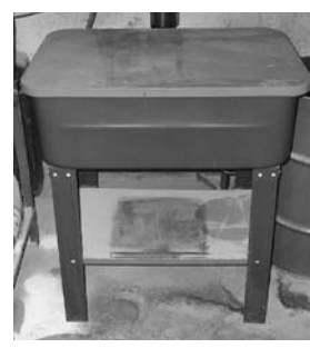
Electric Parts Washer

(2) Misc Wet/Drv Vac's Shop Built Aircraft Porter Mechanics Creepers Jack Stands Drop Lights & Ext Cords Sev 5 Gal Gasoline Can Hand Pump Sprayers Easy Mdl 3B Ringer Washing Machine Barrel Cart Sev Barrel Pumps Table Saw Oxygen Regulator Misc Air Line Fittings 8 Sheets of 5052-H3 Aluminum .190