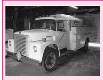
1973 International 1600 Loadstar 1500 Gal AVGAS Truck 4 x 2 Transmission; V-8 Gas Eng; Dual Pump & Meters: 5 Compartment Tank; Top & Bottom Load; Defuel Capable: Steel Tank