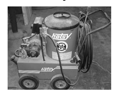
Hotsy MdI 550 B Heated Pressure Washer; 2.2 GPM; 1000 PSI; SgI Phase

Century 6/12/24 V Battery Charger/Starter QULJADA Electric Pipe Threader Cyl Ball Hone Clarke 10 Gal Portable Bead Blast Pot 4' Maintenance Ladders 20' Extension Ladder (2) 5' Ladders Metal Shop Bench on Rollers w/Vice Bench Vice Welding Rod