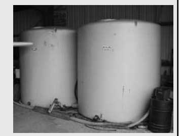
(2) 3000 Gal Wylie Poly Fertilizer Tanks Transland 38" Air Tractor Dry Spreader Transland Cessna 188 Slim line Spreader

Several Couplings, Loading Valves; Loading & Mixing Hoses; Meters; Cam Lock Fittings; 1-3"; 2 Auto Flaggers