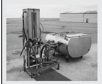
(3) Chemical Mixing & Transfer Pump Rigs; 1 is Portable Pace Transfer Pump w/5HP Briggs Eng (2) Electric Transfer Pumps