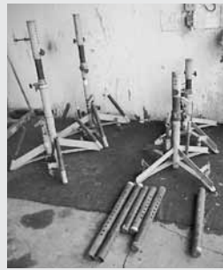
(4) Myers 3 Ton Aircraft Jacks w/ Extensions