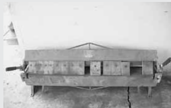
Whitney 42" Finger Brake Continental 30 Ton H-Frame Press Horizontal Air Compressor, 2-Stage, 3-HP, Single Phase Skat Bead Blast Cabinet