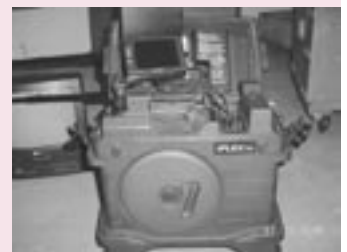
Olympus IPEX Mdl. MAJ-1061 Borescope, Digital Docs Photos, Has DVD Recording & Measuring Capabilities w/Monitor.