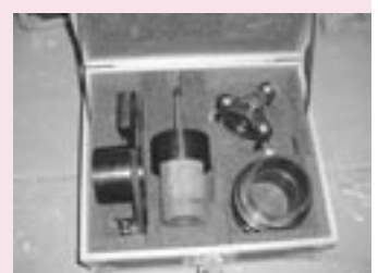
JT-8D-7 Thru - 17 AR C-1 & C-2 Fan Change Kit JT-8D-200 C-1 & C-2 Fan Change Kit JT-8D Standard & -200 Vibration Survey Computer