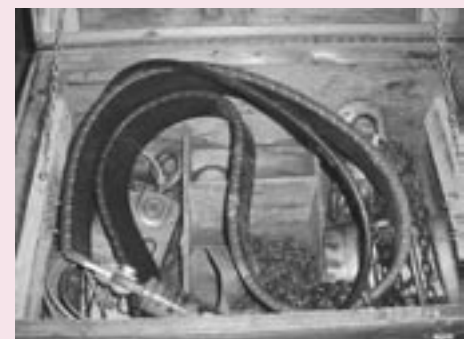
MD-80 Engine Change Kit