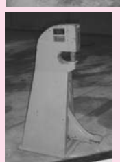
Erco Mdl 187 Foot Operated Sheet Metal Shrinker/Stretching