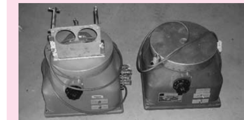
Ideal Aero Smith Model 1275 Instrument Turn Table Range 36, 90, 180, 360 & 1080°/Min (2ea) Ideal Lab 2 Chamber Instrument Press Chambers (2ea) Single Chamber Instrument Press Chambers (2ea) Welch Mdl 1402 Dual Seal Vacuum Pumps (1ea) Welch Mdl 1400 Dual Seal Vacuum Pump

Robinair Mdl 15000 Vac- Pumps Kingsley Mdl KTM-6 Wire Labeling Machine Various Other Kingsley Wire Labeling Machines (3) Bendix Test Panels Including TS-4A Test Panel, TS-810A & TA-4D Test Panels Consolidated Airborne Mdl TF-1820 Fuel Qty Ind Test Set 400 A N-O-M/IFCS Test Set (14+) Tekronix Oscilloscopes Mdl Include 475, 455, T-912, TM-504 & 455 B & K Mdl 1477 Oscilloscopes Tektronix Mdl 491 Spectrum Analyzer Sencore Mdl LC-75 Capacitor Inductor Analyzer Global Mdl 6002 Digital Freq Counter