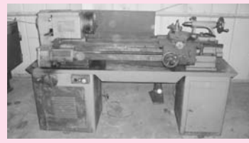
Logan Mdl 6560 Lather; 52' Bed; 15" Swing; Various Tooling & Taper Attachment