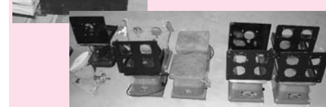
(7ea) Ideal Aero Smith Mdl 1411 Gyro Tilt Tables Range 0° to 15° (30° Included) Ideal Aero Smith Manual Drive Tilt Table 0° to 80° Range