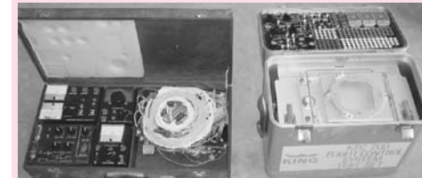
King KHC-200 Flight Control System Test Set (KTS-150) Edo Air Mitchell Mdl 66-D141 Auto Pilot Test Set. Ryan WX-PT Storm Scope Tester