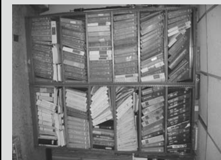
400+ Avionics Manuals to Include King, Narco, Cessna, ARC, Bendix Weather Radar, RCA, Rockwell Collins, Willcox, Etc.