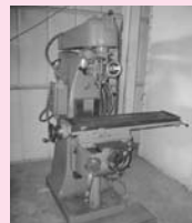
U.S. Machine Tool Mdl VT Vertical Milling Machine; 1.5 HP Motor; 9"x42" Table