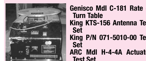
King Nutronics Mdl 3682 Air Data Calibrator Genisco Mdl C-181 Rate of Turn Table King KTS-156 Antenna Test Set King P/N 071-5010-00 Test Set ARC Mdl H-4-4A Actuator Test Set King KTS-149 Serial Data Test Set HP 8005 A Pulse Generator King H-14 Card Tester