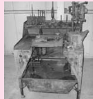
Sioux Mdl 1680 Wet Cylinder Working Table