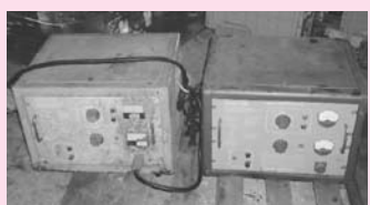
(2) Sonotone Mdl PCA-131 Nicad Battery Charger Analyzers Stoelting Electric Parts Washer; 3 Phase; 460 Volt Degreaser Tank w/Agitator Recip Engine Build Up Stands