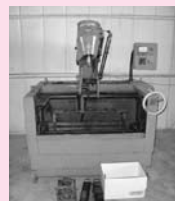
Sunnen Mdl CK-10 Cylinder Honing Machine