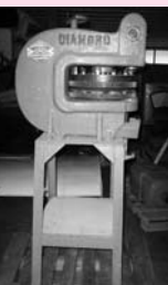
Diamond Machine Co. Mdl 1212 Sheet Metal Hole Punch