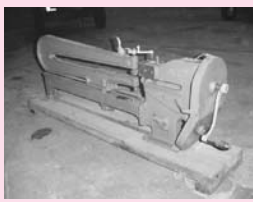
Pexto Mdl 299 Circle Shear; 20 Gauge Cap; 30" Throat Snap-On Mdl ACT - 3000 Refrigerant Recovery/Recycling Center