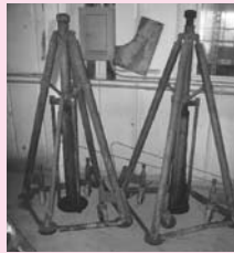
(2) High Wing Tri Pod Aircraft Jacks Kleer-Flo Immersion Solvent Tank Degreaser

Cabin Pressurization Test Unit Cox & Stevens Type D - 1 Electronic Aircraft Scales w/4ea 100,000 Lb Load Cells Approx. 5 Tri Pod Aircraft Jacks; Various Tonnage & Heights Misc Low Wing Tri Pos Jacks; Need Work Champion Spark Plug Cleaner Tester Cleanmaster & Misc Other Electric Parts Cleaners Hobart Mdl HFF24516 Battery Charger Aircraft Maintenance Air Conditioner C&D Airmotive Heater Decay Tester Dumore Tool Post Grinder Cox & Stevens 150,000 lb. Electronic Aircraft Scales w/ (3ea) 50,000 lb. load cells