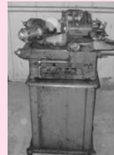
Black & Decker Type A Valve Facing Machine