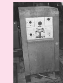
Miller Mdl 220A/BP, AC-DC Inert Gas Welder w/Foot Control