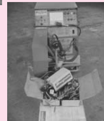
Blue Point Series 7500 Alternator Starter Test Stand