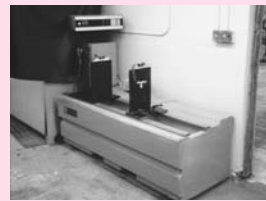
Hines Mdl HC-500 MC Crankshaft Balancer w/ Digital Readout, 6' Bed; Up to 7,200 Rotor RPM