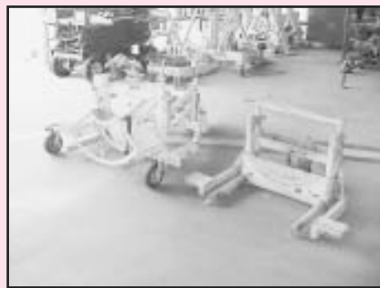
(2 Ea.) Malabar Mdl. 175S-2 Wheel and Brake Dolly and Jack, 600 Lb. Cap. (2 Ea.) Malabar Mdl. 1590 Wheel and Brake Changers, 900 Lb. Cap. (2 Ea.) A-320 APU Stands Brake Bleeder Pot (3 Ea.) Water Hoses and Reels 100+ Safety Pylons 100+ Ballast Bags

A 3% BUYER'S PREMIUM WILL APPLY TO ALL PURCHASES AT THIS AUCTION.