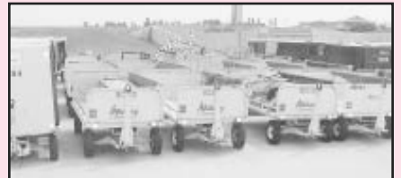
(Approximately 44) Bentz Mdl. 24AF Open Baggage Carts w/Roll Over Covers NOTE: Most of the Bentz Baggage Carts were mfg. in 2000 and 2001.