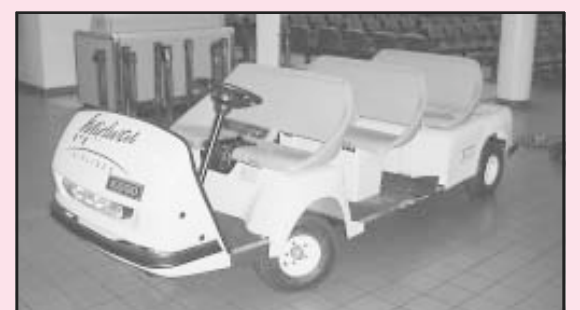
(2 Ea.) EZ-Go Electric Carts Triple Station Curb Side Check-In Counter Single Station Curb Side Check-In Counter Large Selection of Drop and Misc. Safes Several Baggage Sizers (Chrome) Stanchions; Ticket Validators; Manual Credit Card Machines; Several Ticket Agent Cash Boxes