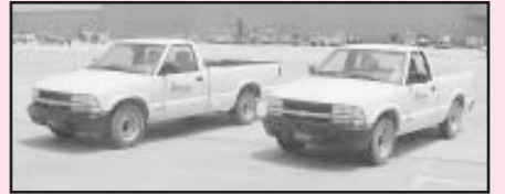
(4 Ea.) Chevy S-10 Pickups, Years Range From "95" to "01", 4 Cyl. and 6 Cyl. Engines, All Have Auto Trans.