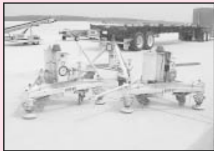
(2 Ea.) Hydro Mdl. DT2515E2DIB Fokker F-100 Wing Jacks, 25 Ton, Air Over Hyd. Hydro Mdl. DT0623A1D1B01A0 Fokker F-100 Nose Jack (2 Ea.) Tronair Mdl. 02-2560-0100-01 Aircraft Jacks, 50 Ton Air Over Hyd. Tronair Mdl. 02-7810-0100-01 Aircraft Jack, 12 Ton Air Over Hyd.