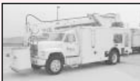
1993 Ford F-700 De-Ice Truck w/FMC Trump Mdl. 2000, De-Ice System, 1,700 Gal. Type 1, 300 Gal. Type 4, Dual Heaters, 40' Boom, Top and Bottom Load, (Very Little Use)