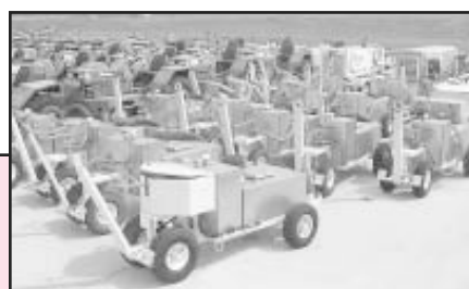
(13 Ea.) Davco Mdl. LC-60-30 Lav-Carts, 60 Gal. Waste, 30 Gal. Water, Stainless, Mfg. '99' and 2000