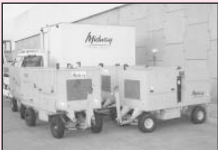
(6 Ea.) Spencer Industries Cold Buster Mark I, Aircraft Heater Carts, Ford 6 Cyl. Engines, Mfg. '98' and 2000