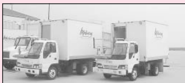
(6 Ea.) Isuzu Narrow Body Catering Trucks, 4 Cyl. Diesel Engines, 13 Ft. Boxes, Mfg. "99" (Approximately 200) Driessen P/N TKO-75059 Catering Carts, Misc. Waste Carts Large Selection of Plastic and Stainless Steel Catering Cart Inserts Large Selection of Aluminum and S.S. Food Carriers Hang On Ice Buckets for Carts Aircraft Aisle Wheelchairs 90+ Cases of Drink Glasses, Logoed and Plain

Wine and Champagne Glasses Porcelain Coffee Cups Large Selection of China Plates and Bowls Silverware (Forks, Knives, Spoons) Logoed and Plain Salt and Pepper Shakers; Wicker Baskets; Plastic and Styrofoam Deli Boxes; Styrofoam Cups; Stainless Steel Coffeepots; Ice Buckets and Tongs; Plastic Serving Trays; Snack Tuck Top Boxes; Placemats; Beverage Napkins; Cases of Plastic Bags (Logoed and Unlogoed); Plastic Can Liners; Company Mailbags; Midway Umbrellas; Lavatory Deodorant; Sani Blue Plus; Hand Soap; Cases Toilet Paper Rolls; Cases of Kleenex; Sanitary Napkins; Pillows and Pillowcases; Blankets; Toilet Seat Covers; Motion Sickness Bags; Unaccompanied Minor Pouches; Dog Kennels; Small, Medium and Large Cloth Napkins; C-Fold Towels; Plastic Spoons; Latex Gloves; Etc.