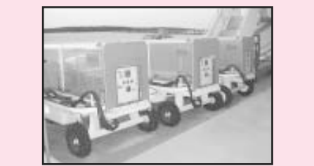
(3 Ea.) Davco Ground Power Units, Pull Type, Cummins Diesel Engines, Marathon Magnaplus Generators, 100 K.W., 125 K.V.A. (Nearly New) Davco Ground Power Unit, Pull Type, Cummins Diesel, 50 K.W., 62.5 K.V.A.