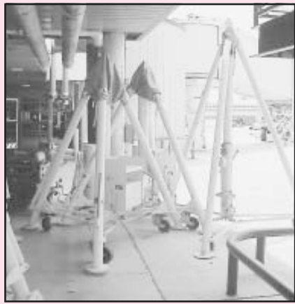
(2 Ea.) Malabar Mdl. 8731 Aircraft Jacks, 33 Ton, A-320 Wing Jacks, Air Over Hyd. Malabar Mdl. 8722 Aircraft Jack, 6 Ton, A-320 Nose Malabar Mdl. 8721 Tripod Jack, 10 Ton