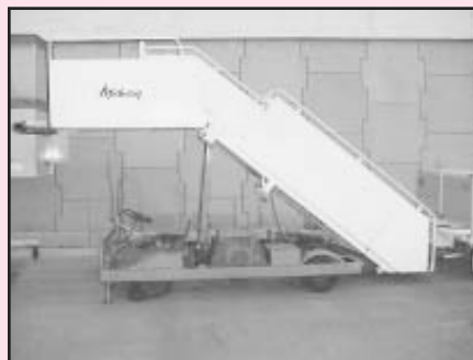
Stinar Narrow Body Air Stair Truck (2 Ea.) DCF Roll-A-Round Passenger Air Stairs, 1,550 Cap. AAIACL Technology Mdl. 9780-0331 Hydraulic Servicing Cart, Skydrol, 50 Gal. Per Minute @3,000 PSI