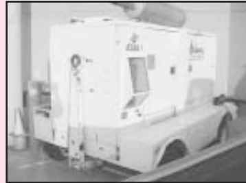
Stewart Stevenson Mdl. TMAC-150 Air Start Unit, Detroit Diesel Engine, Single Unit, 150 Lbs. of Air Per Minute @32 PSIG