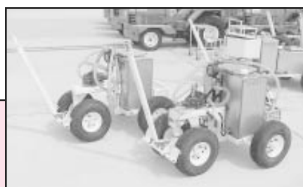
(3 Ea.) Davco Mdl. PW-30 Portable Water Carts, Stainless, 30 Gal.