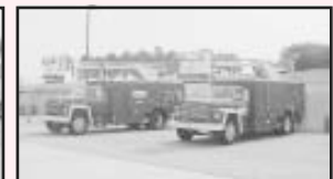
(2 Ea.) '89 Ford F-800 De-Ice Trucks, 429 V-8's, w/Trump Mdl. D24-40 De-Ice Units, 2,000 Gal. Type 1, Dual Heaters, 40' Boom, Top and Bottom Load