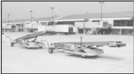
(39 Ea.) Wasp Mdl. A01771D-3305 Walk Behind Belt Loaders, 2,000 Lb. Cap. (Narrow Body or Regional Jet), Mfg. Between '98' and 2001 (2 Ea.) Cochran 660 Wide Body Belt Loaders, 2,000 Lb. Cap., 6 Cyl. One may need work.