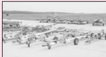
(Approximately 13 Ea.) Boeing 737 Tow Bars (7 Ea.) Airbus A-320 Tow Bars (6 Ea.) Fokker F-100 Tow Bars Electric Scissors Lift Nissan Mdl. 60 Forklift, 6,000 Lb. Propane, Hard Rubber, 16' Triple Mast