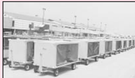
(Approximately 136 Ea.) Bentz Mdl. 34ALB and Wasp Baggage Carts, 4,000 Lb. Cap., Both Divided and Cargo Type