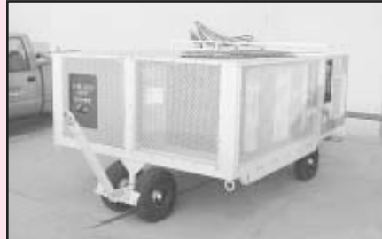
Davco Pull Type Air Conditioning Cart, Cummins Diesel Engine, (New, Never Used)