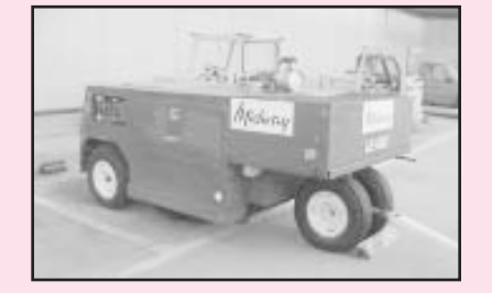
(2 Ea.) Stewart Stevenson Mdl. TMSS-120 Air Start Units, Detroit Diesel Engines, Single Unit, 120 Lbs. Air Per Minute @ 32 PSIG Stewart Stevenson Mdl. BT-345 Tow Tractor, 5,000 Lb. D.B.P., Ford 6 Cyl., Auto Trans. (2 Ea.) AM Ground Equip. Int'l. Mdl. 1012 Tugs, 6,000 Lb. D.B.P., 6 Cyl. Ford, Auto Trans., Rebuilt in 2000