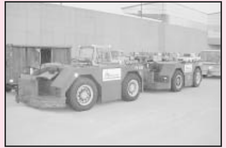
(4 Ea.) Stewart Stevenson Push Back Tractors, Mdl. 1628, 24,000 Lb. D.B.P., Detroit Series 53 Diesel Engines, Auto Trans., Mfg. Late '80's', Early '90's"