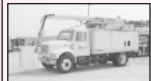
1998 International 4700 De-Ice Truck w/Int'l. T444 E Diesel Engine, Has Global De-Ice System, 1,000 Gal. Type 1, 200 Gal. Type 4, Tanks, 40' Boom, Top and Bottom Load, (Nearly New)