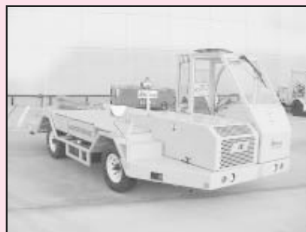
(3 Ea.) Accessory Controls & Equip. Mdl. 1410RJ-FD Lavatory Service Units, Drive Around, 500 Gal. Waste, 300 Gal. Water, Pumping Cap. 24 G.P.M. @40 P.S.I., 4 Cyl. Gas Ford Engines, Mfg. 2000 and 2001 1980 Ford Lav Truck, 500 Gal. Waste Tank, Auto Trans., V-8