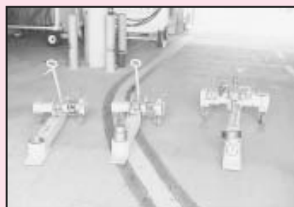
(3 Ea.) Malabar Mdl. 832R 35 Ton Axle Jacks Regent Mdl. 2150-8 Alligator Jack, 50 Ton, Air Over Hyd. Kalamazoo Horizontal Band Saw Gas Powered 5 H.P. Portable Air Compressor (2 Ea.) Electric Portable Air Compressors Miller Millermatic 250 CV-DC Arc Welder Power Source and Wire Feed