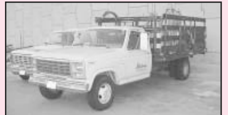
1981 Ford F-350 Custom Stake Bed Truck, V-8, 4 Speed Trans. w/Tommy Lift