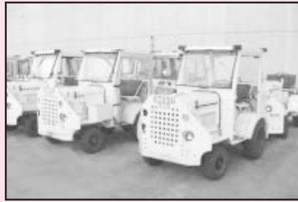
(23 Ea.) Kubota Baggage Tugs, Mdl. L-2550, 3 Cyl. Diesel Engines, Auto Trans., Mfg. in '87"