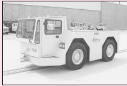
(7 Ea.) Stewart Stevenson Push Back Tractors, Mdl. GT-35A, 20,000 Lb. and 22,000 Lb. Deutz Mdl. BF4M-1012 Diesel Engines, 3 Speed, Mfg. in '99', '00' and 2001