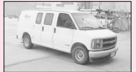
1998 Chevy 1500 Full Size Van, Auto Trans., V-8, Air Conditioning, AM/FM, Low Miles