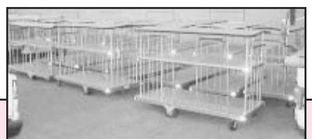
(9 Ea.) Express Aluminum Push Type Carry On Baggage Carts

A 3% BUYER'S PREMIUM WILL APPLY TO ALL PURCHASES AT THIS AUCTION.