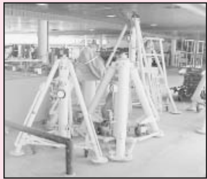
(2 Ea.) Malabar Mdl. 714A Aircraft Jacks, 12 Ton (737 Nose) (2 Ea.) Malabar Mdl. 759A Aircraft Jacks, 50 Ton, (737 Wing) Air Over Hyd.