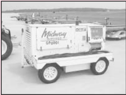
Hobart Mdl. 90PL20P Ground Power Unit, Perkins Diesel Engine, 90 K.V.A., 72 K.W.