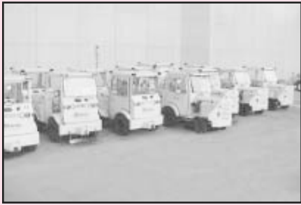
(6 Ea.) Tug Mdl. MA-60-1 Baggage Tugs, Ford 6 Cyl. Engines, Auto Trans., 6,000 Lb. D.B.P., Most w/Cabs, All Mfg. in 2000 (20 Ea.) Tug Mdl. MA-50-1 Baggage Tractors, Ford 6 Cyl. Engines, Auto Trans., 5,000 Lb. D.B.P., Most w/Cabs, Mfg. in '99' and 2000