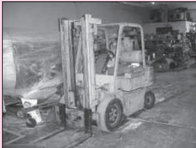
Caterpillar 4,000 Lb. Forklift, Propane, Hard Rubber Tires, Dual Stage 12 Ft. Mast