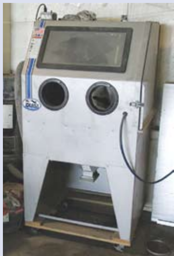
Ex-Cell 2800 PSI Power Washer w/Honda GX200 Gas Engine

SCAT Blast Bead Blast Cabinet w/ Reclaimer, 28 x 27 x 34 (2) 24' Aircraft Tripod Jacks Barrel Top Parts Cleaner Pontiac Sunbird Car, 4 Cyl Engine, 4 Door, No Title, Set up for Aircraft Tug, No Title (2) Wet Dry Vac's Max Air 42" Shop Fan Portable Helicopter Landing Trailer (2) Bracket Mdl TH-53 Tow Bar 2 Place Nitrogen Cart w/Regulators