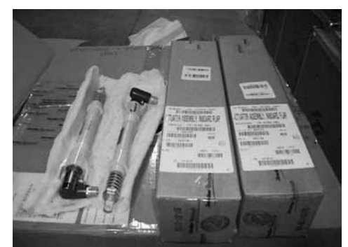
New Beech Flap Actuators

NOTE: The Majority of this Inventory is for P&W PT6A-67D & Possibly the PT6A-42 Engines. New Turbine Discs, A/R Turbine Discs w/Time Remaining, New 1 st Stage Compressor Rotors, Impellers, CT Discs, 1 st & 2 nd Stage PT Discs, New Combustion Inner & Outer Liners, CT Blades, CT Air Seals, Bleed Air Valves, Fuel Valves, Exit Ducts, Rear Compressor Hub Couplings, 'O/H' Bearing Housings, CT Oil Nozzles, Compressor Stators, Thermocouples, CT Discs, Several Exciter Boxes, Fuel Oil Heaters, Compression Turbine Vane Rings, Fuel Control Units, Over-Speed Governors, Several Fuel Control Units, Prop Governors, HP Fuel Pumps, Fuel Check Valves, Oil Coolers, Fuel Pumps, Fuel Valves, Starter Generators, Bearings, Brackets, Strainers, Pump Housings, Wire Harnesses, Etc.