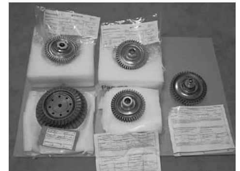
Overhauled Turbine Wheels & Impellers

TPU-67A TCAS-II Processors "O/H" & "A/R" TCAS-I Processors, TCAS-I Computers & Displays, King KLN-90B GPS's, TCAS/VS Indicators, TCAS Mode S Control Heads, Air Data Computers #622-8051-003, Air Data Modules #622-8692-008, Autopilot Computers #622-9724-105, Autopilot Control Panels #622-6684-002, Collins Primary & Elevator Trim Servos, Altitude Preselects & Alerts, TDR-90 Transponders, RMI Indicators #622-2506-014, Flight Director Indicators, Collins WX Radar Control Panels & Indicators, Flight Guidance Computers (FGC-65), Collins VIR-32's, VHF-22A's, HSI Processors, Electronic Flight Displays, DME-42 Transponders, Collins Com & Nav Control Heads, ADF & ATC Control Heads, Weather Radar Recur/Trans., ADF Receivers, TDR-94D Transponders, Display Processor Units #622-9682-004 & -002, EFD-84's #622-9681-001, APC-65H's #622-9724-105, RSA Displays, TCAS Indicators #805-10007-007, Cockpit Voice Recorders, EPWS Computers, EGPWS Computers #965-1186-011, Air Data Modules, Several Other Pieces, Large Selection of Very Good Avionics!