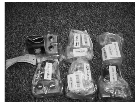
Beech Gear Box Assemblies

(2) Main Gear Assys. 'A/R', Nose Gear Assy. 'A/R', Nose Landing Gear Drag Braces, Bushings, MLG Hyd Actuators, Brake De-Ice Valves, Several Brake Assys., Anti-Skid Tubes, Several Main Wheels, Main Gear Drag Links, Anti-Skid Boxes, Brake De-Ice Manifolds, Main Gear Doors, Nose Gear Doors, Shimmy Dampers, Steering Arms, Wheel Speed Transducers, Power Steering Amplifiers, Cleveland Brakes, Cleveland Wheels, Anti-Skid Computers, Brake Rotating Discs, Nose Gear Drag Braces, Brake Master Cylinders, Landing Gear & Wheel & Brake Hardware, Etc.