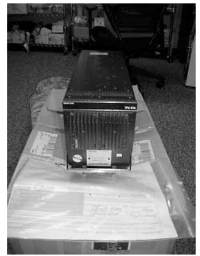
King TPU-67A TCAC Processor

APPROXIMATELY 4,200 LINE ITEMS OF BEECHCRAFT INVENTORY FOR THE BEECH KING AIR'S – BEECH 99'S & 1900'S. ALSO PRATT & WHITNEY ENGINE INVENTORY INCLUDES NEW, OVERHAULED AND SOME AS REMOVED.