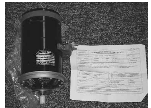
Overhauled Starter Generator

Several 100 Instruments to Include New, 'O/H' & Some 'A/R' Encoding Altimeters, RMI's, Flight Director Indicators, Vertical Gyros, Turn & Banks, VSI's, Several Annunciators, Altitude Gyros, Volt & Amp Indicators, Fuel Qty. Indicators, Prop RPM Indicators, N1's Torque Indicators, Fuel Flows, Oil Pressure, Air Speed, Cabin Temps., Oxygen Gauges, Turbine RPM's, Flux Detectors, Directional Gyros, Etc.