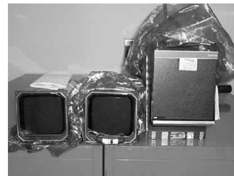
Collins Receivers & Indicators

New Nacelle Fairings, Battery Boxes, New Windshields, Nose Radoms, Pulley Brackets, Door Latch Shafts & Handles, Supports, New Cap Spar Assys., Upper Skin Wings, Sub Panels, De-Ice Boots, Fire Pull Handles, Hinges, Control Cables, Brackets, Angles, Bulkheads, Servo Supports, Fire Tubes, Exhaust Stacks, Hyd Reservoirs, Weld Assys., Bell Cranks, Complete Cowling Assys., Cowl Side Panels, Upper & Lower Cowl Assys., Nacelle Skins, Stiffeners, Aft Door Bond Assys., Inspection & Access Panels, Doublers, Wing Skins & Leading Edges, Oil Cooler Fairings, Plates, Crew Oxygen Masks, Sub Panels, PSU's, Coat Closet Walls, Air Stair Door Structure Bond Assys., Emergency Exits, Cargo Door Frames, Bottom Angles, Tail Cones, Dorsal Fins, Push/Pull Tubes, Air Ducts, Engine Trusses, Door Cables & Inv., Engine Fire Bottles, Control Wheel Grips, Spinner Bulkheads, Spinners, AFT & Fwd Fairings, Etc. If it fits K.A.'s, 99's or 1900's ITS HERE!