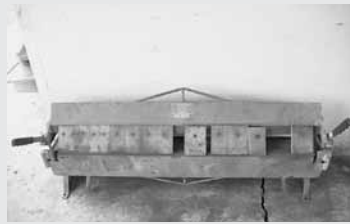
Whitney 42" Finger Brake Continental 30 Ton H-Frame Press Horizontal Air Compressor, 2-Stage, 3-HP, Single Phase Skat Bead Blast Cabinet